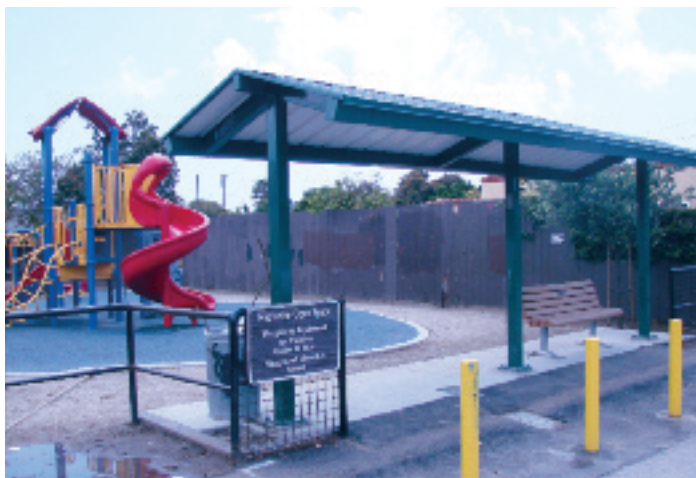
New bus shelter in front of Nectarine Park, a small neighborhood park that serves the residents of Old Town north of Hollister Avenue.