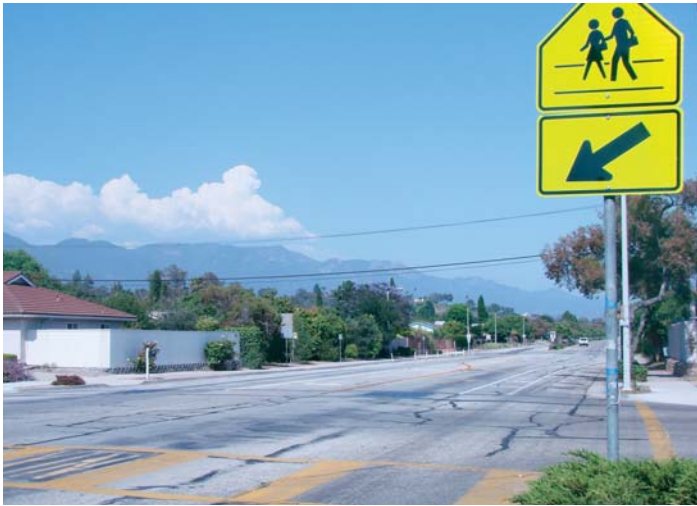
The Cathedral Oaks Rd. and Carlo St. intersection is one area slated for summer road work.