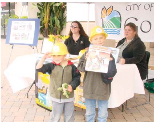
Community Services staff and local children commemorate May's Public Works Week in Goleta.

For more info, call 964.4407 or visit www.goletahistory.org